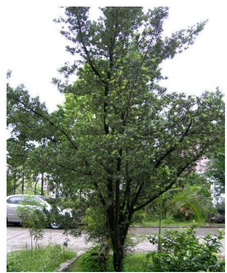
One of Hong Kong's increasingly rare trees - the indigenous Buddhist Pine

Astroturf surface while large areas of the site have moved to natural greenery and an increasing range of forms and colours. Not all of these 'nature' developments are new; there has been an ecological pond for many years, for example, and a large variety of trees and shrubs have been planted over a considerable period. The footprint of the 'green lung' of KGV is well recognized and used by birds including kingfishers while fruit bats have a long-established 'home' in their favourite palm tree.