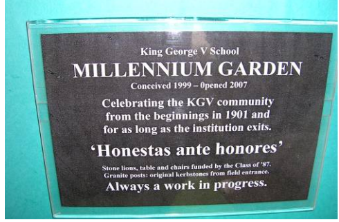
Plaque commemorating the gardens

The KGV school site has undergone many significant changes over the years in terms of building developments to meet the needs of an ever-expanding school population and curriculum.